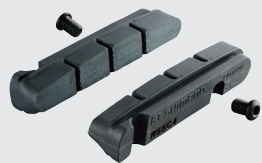
R55C4 for carbon rim